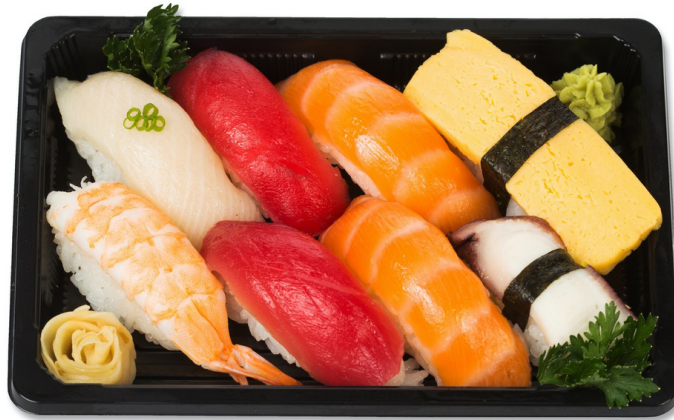
8 pc Nigiri

Roasted Nori Sheet, Sushi Rice, Hamachi, Tuna, Salmon, Tamago, Octopus, Shrimp