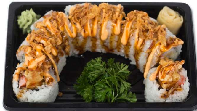
Shrimp Tempura Roll

Roasted Nori Sheet, Cucumber, Imitation Crab Sticks, Shrimp Tempura, Avocado, Carrot, Soy Sauce, Sushi Rice