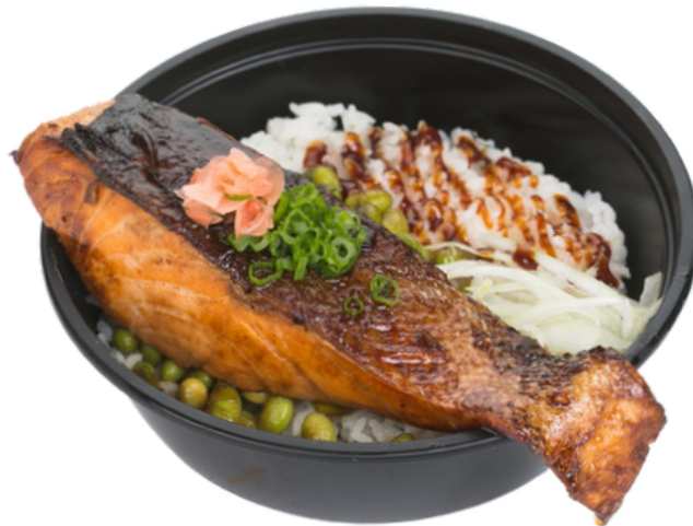
Grilled Salmon Bowl

Similar yet different from 'Bento' in that you can experience more of other Asian foods such as Thai and Korean fusion dishes.